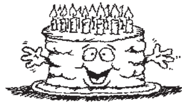
Look Who's Having a Birthday!